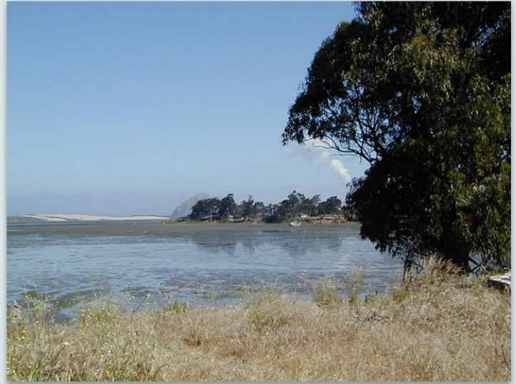
A natural drainage wetland with cattails adjacent to a eucalyptus forest in the Sweetwater Nature Preserve in Los Osos. This area naturally treats some of the existing stormwater runoff prior to entering the bay.